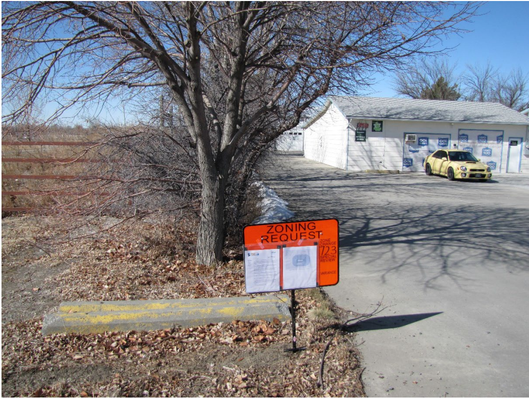
Subject Property view from S 48 th St W