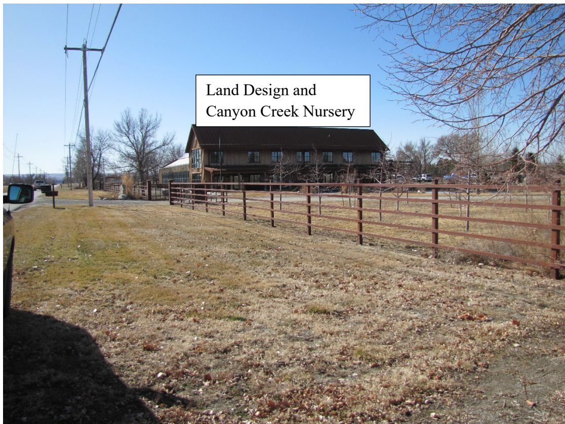
View south on S 48 th St W