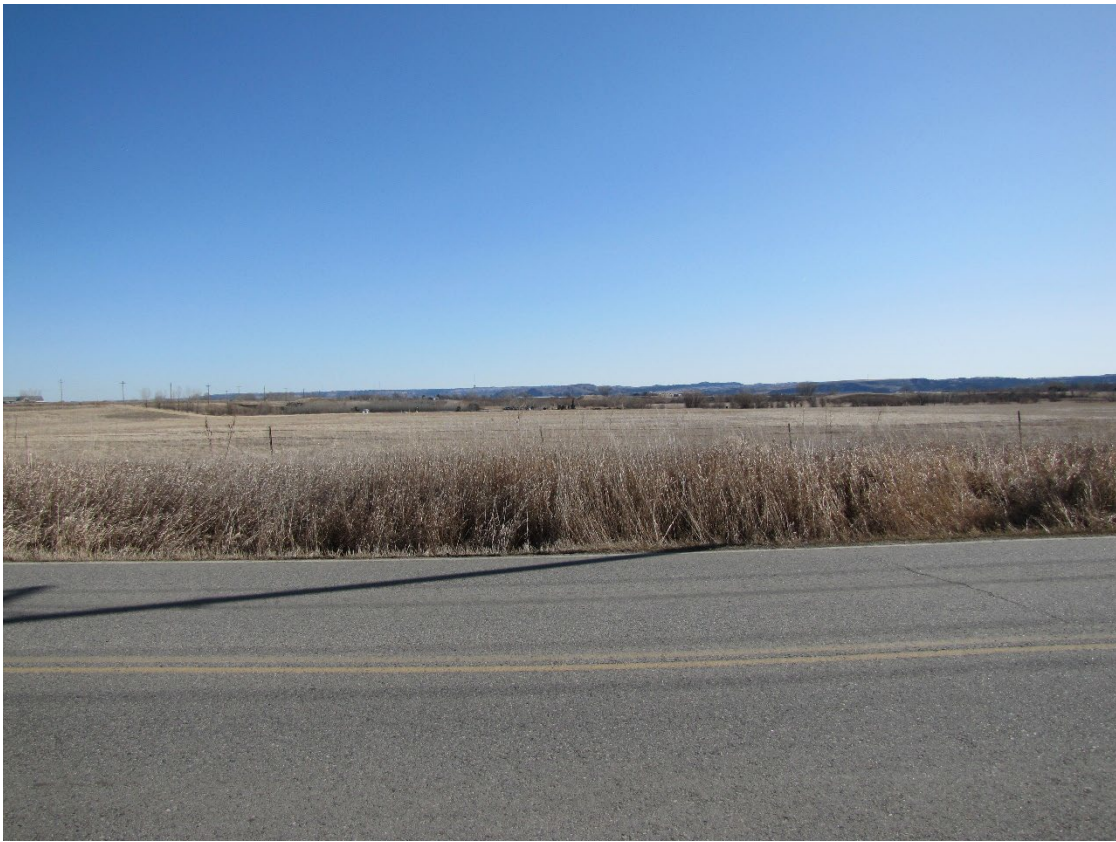
View east across S 48 th St W