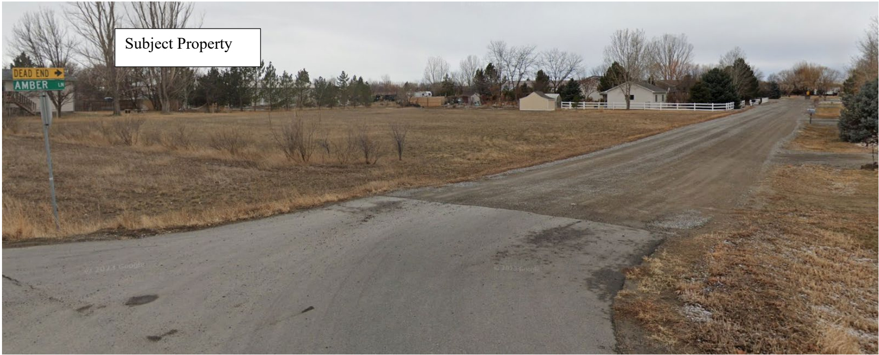
View south and west from Amber Lane to subject property