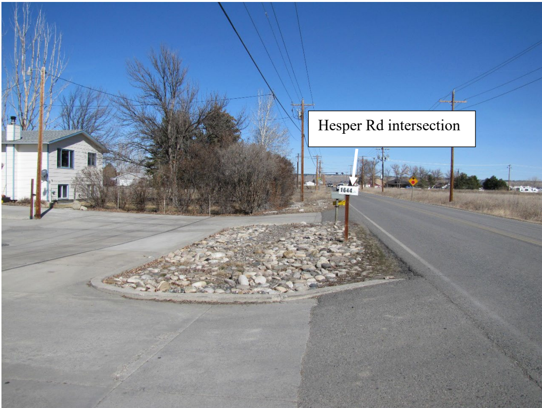
View north on S 48 th St West