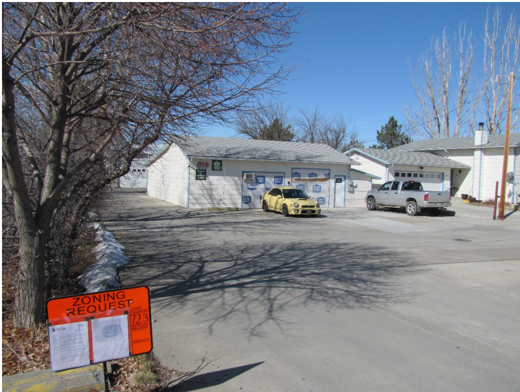
View of The Green Bee retail building