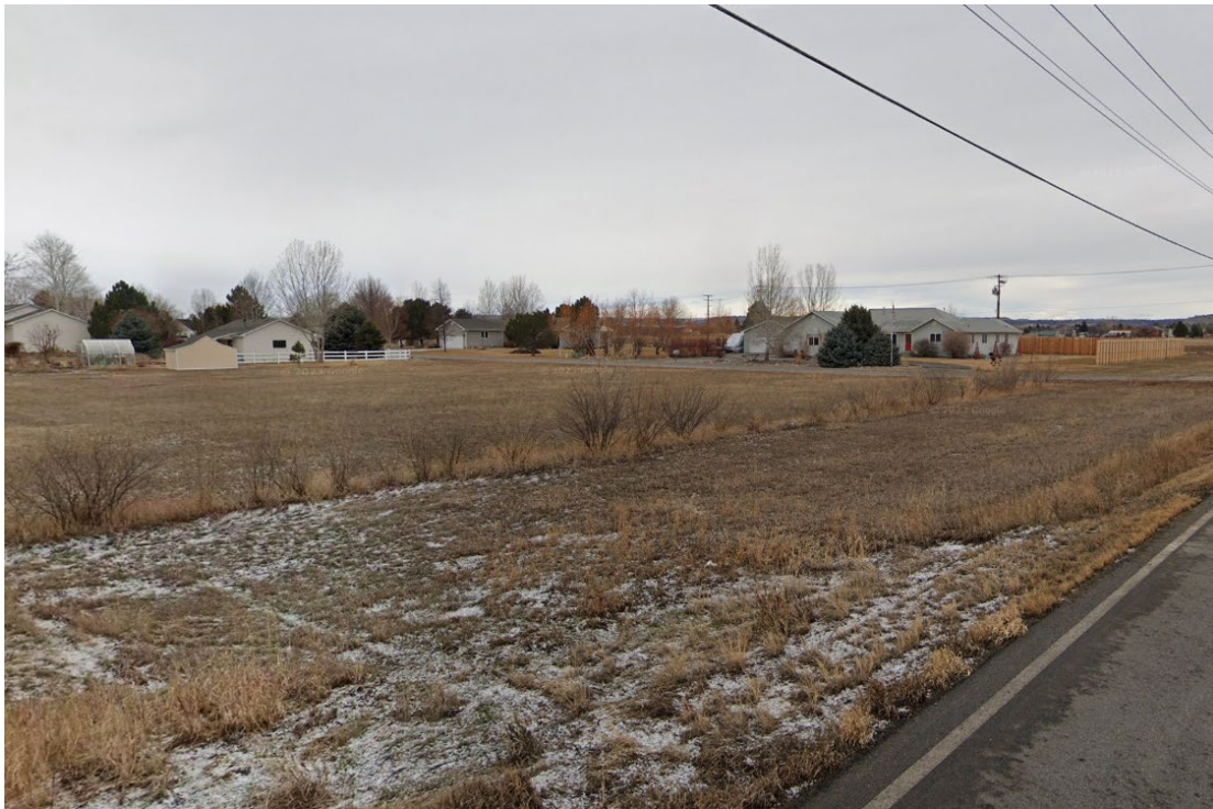
View to the northwest of the subject property